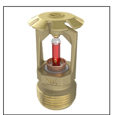
NOTE: As of May 2018 all logos have been removed from the wrench boss.

Temperature Suffix (°F/°C): 135^{\circ}/57^{\circ} = A, 155^{\circ}/68^{\circ} = B, 175^{\circ}/79^{\circ} = D, 200^{\circ}/93^{\circ} = E, 212^{\circ}/100^{\circ} = M, 286^{\circ}/141^{\circ} = G, 360^{\circ}/182^{\circ} = H