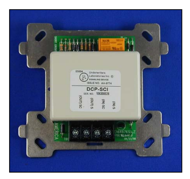
Back side of a DCP-SCI

The contractor shall furnish and install where indicated on the plans, the Hochiki DCP-SCI short circuit isolator. The modules shall be UL listed compatible with Hochiki Digital Communications Protocol (DCP) supporting control panel loops. The isolator module must be suitable for mounting in a standard 4" square electrical box or double gang. The isolator module must provide a yellow LED for indication of status.