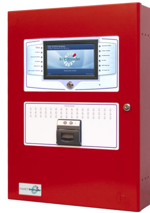
Double Aperture Includes Zone LED Module and Printer